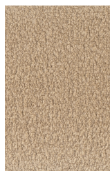
LIPARI - 15 - PLATINUM