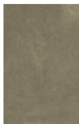
NUBUK - 3409-B - PLUS