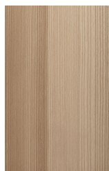
Frassino color sabbia