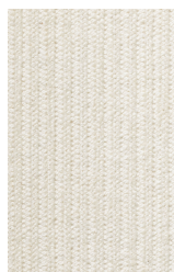
BERNINA - 25 - EXTRA

With the Dao Soft sofa, designer Gordon Guillaumier proposes a modular system that focuses on planning freedom and the geometric harmony of soft, calibrated volumes. Designed to create environments devoted to well-being and calm, the Dao Soft sofa stands out for its ability to adapt to formal or informal settings, thanks to balanced proportions and a discreet but recognizable aesthetic. High backrests and seats with differentiated polyurethane padding and Cloud Foam and Microflock inserts ensure great comfort, meeting the needs of the project in both residential and contract settings. Available in two variants - Dao Soft Base, with an upholstered base, and Dao Soft Light, with black feet - the collection is completed with a strong sartorial connotation, expressed in the sewing "a pizzicotto" that features the cover either in fabric or leather with a precise, textural hallmark. In the proposed versions, the Dao Soft sofa is explored through different spatial solutions, to offer concrete tools in defining welcoming, flexible environments consistent with a measured and contemporary design language.