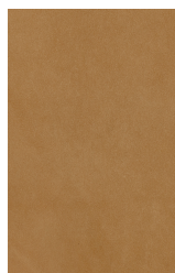
NUBUK - 3421-B - PLUS