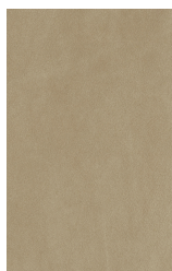
NUBUK - 3405-B - PLUS